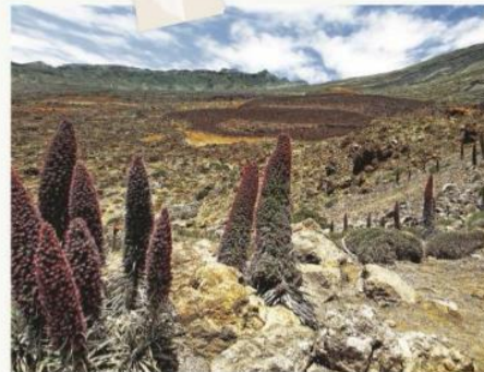
Canary Island landscape