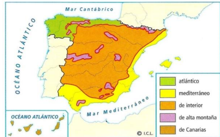
3. LOS PAISAJES DE ESPAÑA.